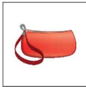
Bags smaller than 6" x 6" x 6"