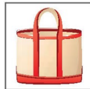
Over-sized Tote Bag