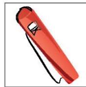
Folding Chair Bag (Folding Chair is Allowed)

FOR MORE INFORMATION GO TO PGATOUR.COM/ProhibitedItems