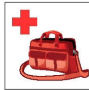
Medically Necessary and Diaper Bags*

*Infant and Medical supplies will be permitted after proper inspection.