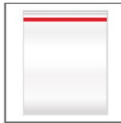
1-Gallon Plastic Freezer Bag